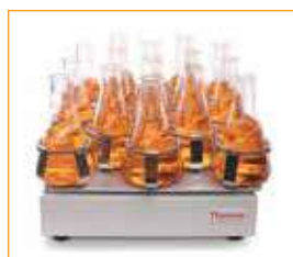
CO 2 Resistant Shaker