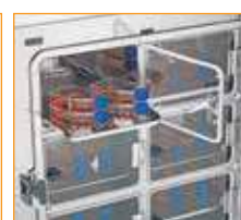
Gas Tight Inner Doors with Split Shelves