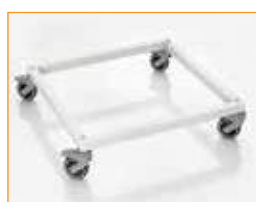
Castor Frame, 172 mm