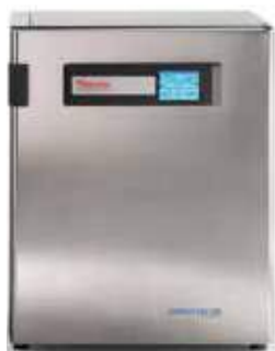
External stainless steel option for easy cleaning and GMP environments

* Factory installed options may only be added to single chamber unit part numbers.