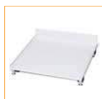
Castor Frame, 73 mm