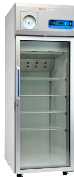
Thermo Scientific™ TSX 23 cu ft refrigerator