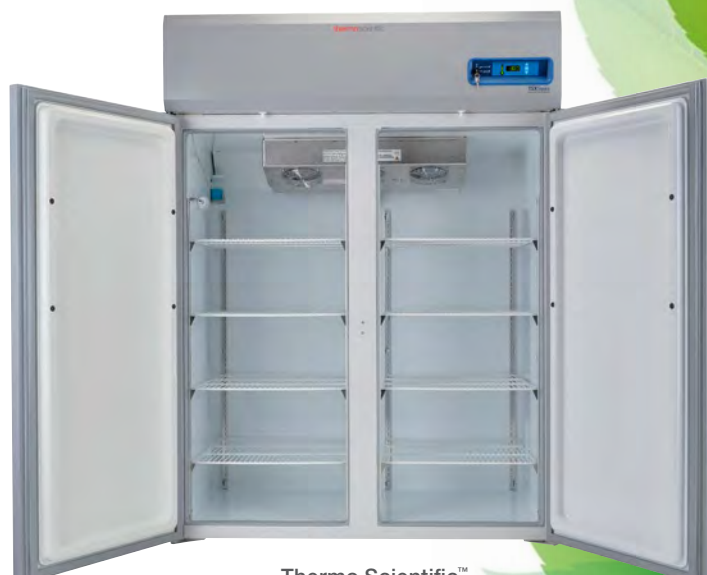
Thermo Scientific™ TSX 50 cu ft refrigerator