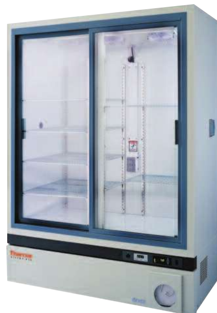
REC4504 chromatography refrigerator with sliding glass doors as standard. Shown with optional temperature recorder.