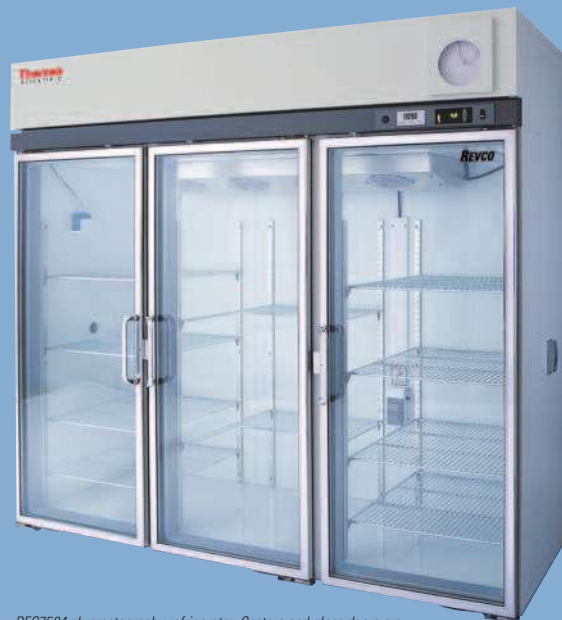
REC7504 chromatography refrigerator. Casters and glass doors are standard. Shown with optional temperature recorder.

Our chromatography refrigerators are designed for a variety of applications requiring close temperature control, full access to chromatography instrumentation and easy set-up of instrumentation and apparatus within the chamber.